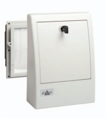
Outdoor filter fan