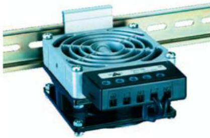
Shown: 100 W - HVL 031 Fan Heater