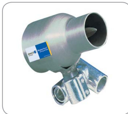
Magnum Force Air Nozzle